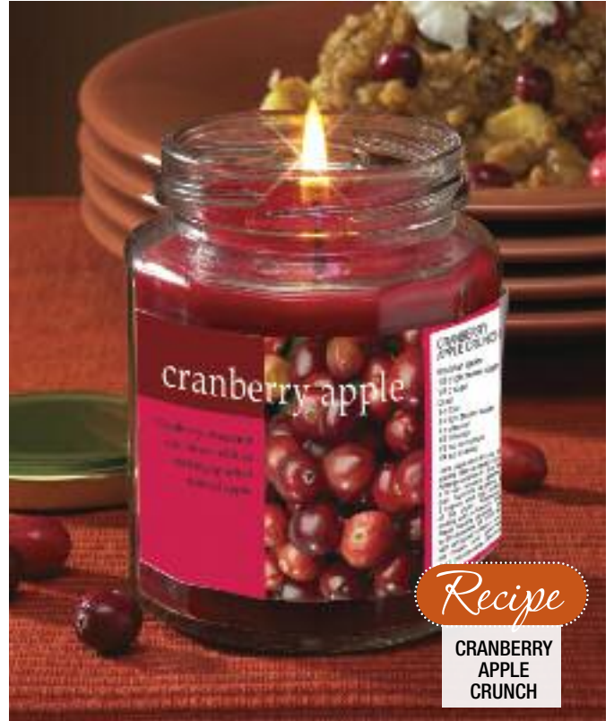
9541 Cranberry Apple Cranberry, cinnamon and clove - with an exciting splash of ripened apple. 6.5 oz. 45 hour burn time. 3-3/4" H. Gift boxed. $9.50