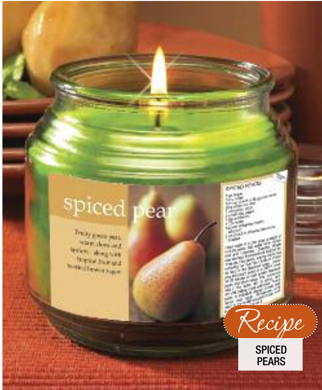
9528 Spiced Pear Fruity green pear, warm clove and apricot – along with tropical fruit and toasted brown sugar. 16 oz. 105 hour burn time. 5-1/2" H. Gift boxed. $18.50