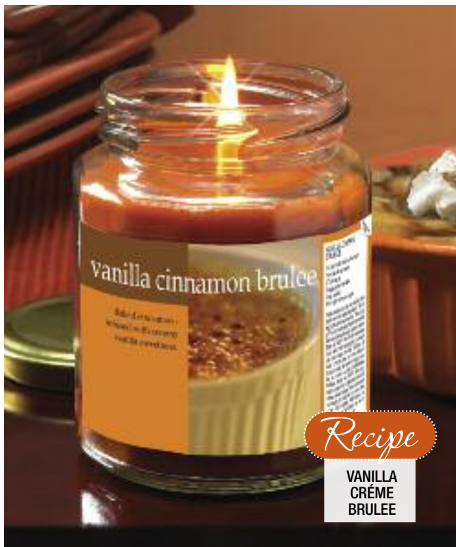
VANILLA CRÈME BRULEE