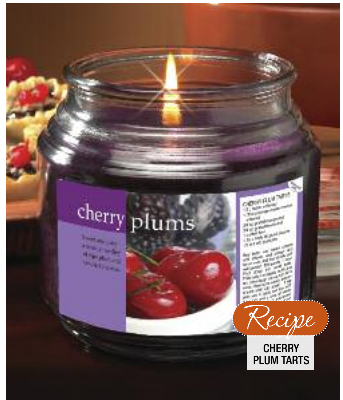
CHERRY PLUM TARTS